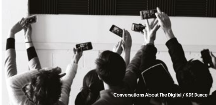
Conversations About The Digital / KDE Dance