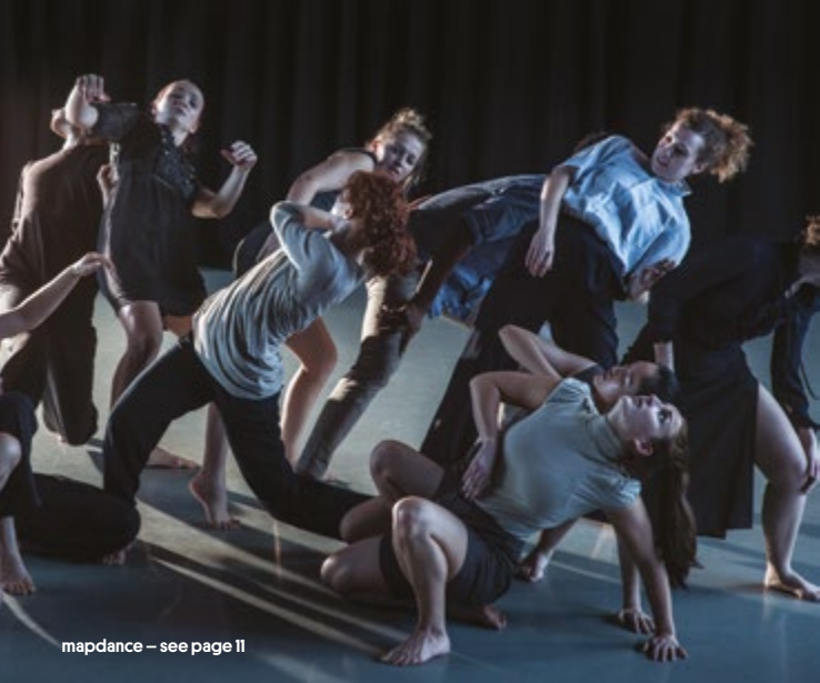
mapdance – see page 11

for the 2018 festival to celebrate the birthday of her Majesty, Queen Elizabeth II. With just a hint of chaos borrowed from Alice In Wonderland's Mad Hatter, the work is a family friendly, interactive performance designed for festivals and space both indoor and outdoor.