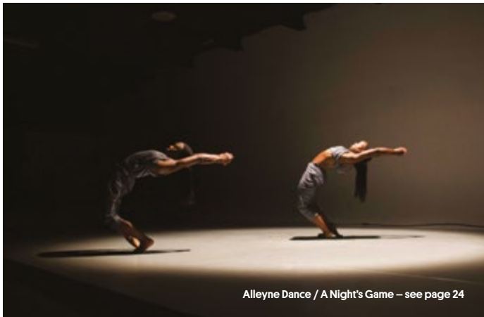
Alleyne Dance / A Night's Game – see page 24